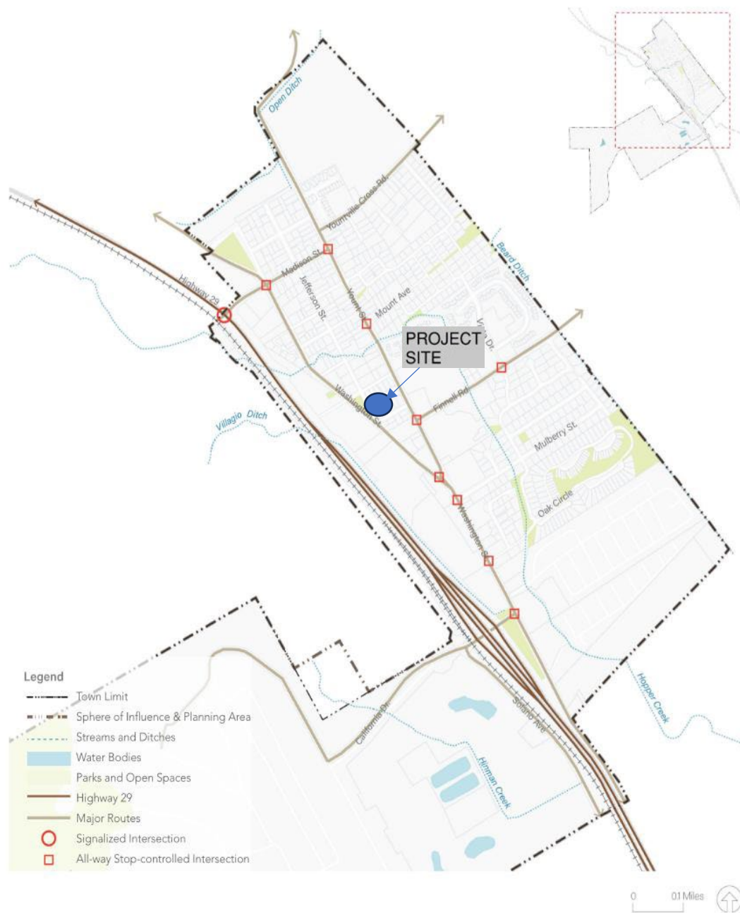
FIGURE 3 CIRCULATION NETWORK